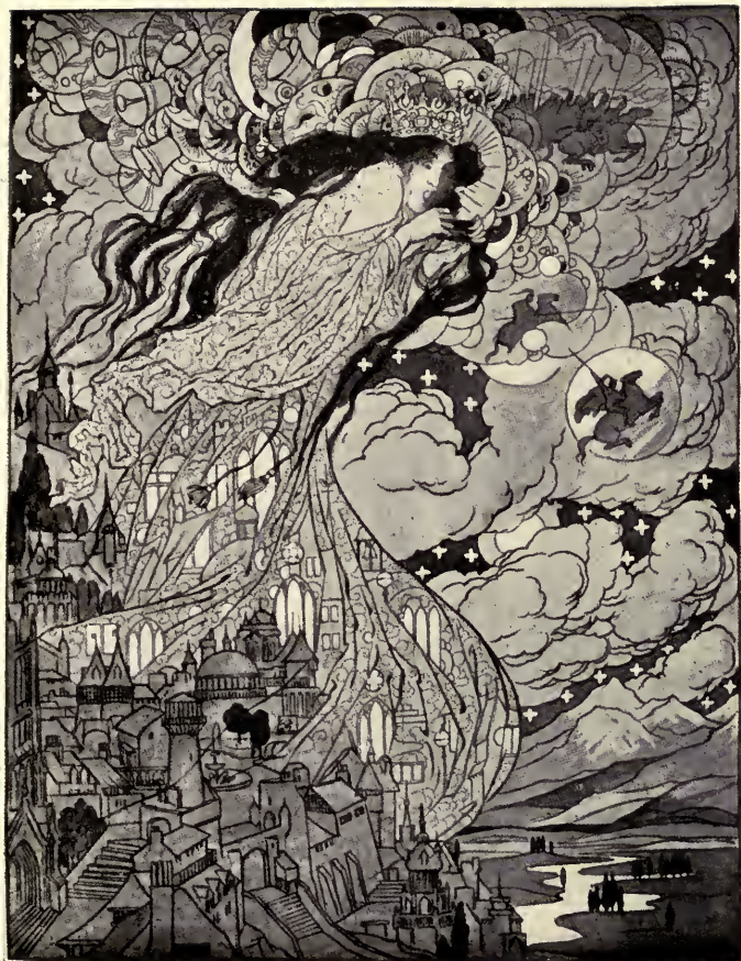
THE SOUL OF ANDELSPRUTZ